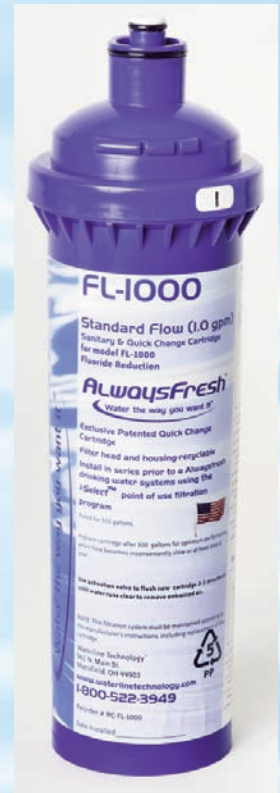
Replacement Cartridge PN# RC-FL-1000

Typical Applications: Point of Use treatment for drinking water residential & commercial