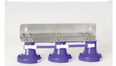
Triple Filter Head Parallel Flow 2.1 gpm PN# HFH-38QC-SS-3P

Dimension rough in 17.5"w x 5.25" h x 4" d