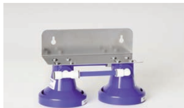
Twin Filter Head Parallel Flow 1.5 gpm PN#HFH-38QC-SS-2P

Dimension rough in 13"w x 5.25" h x 4" d